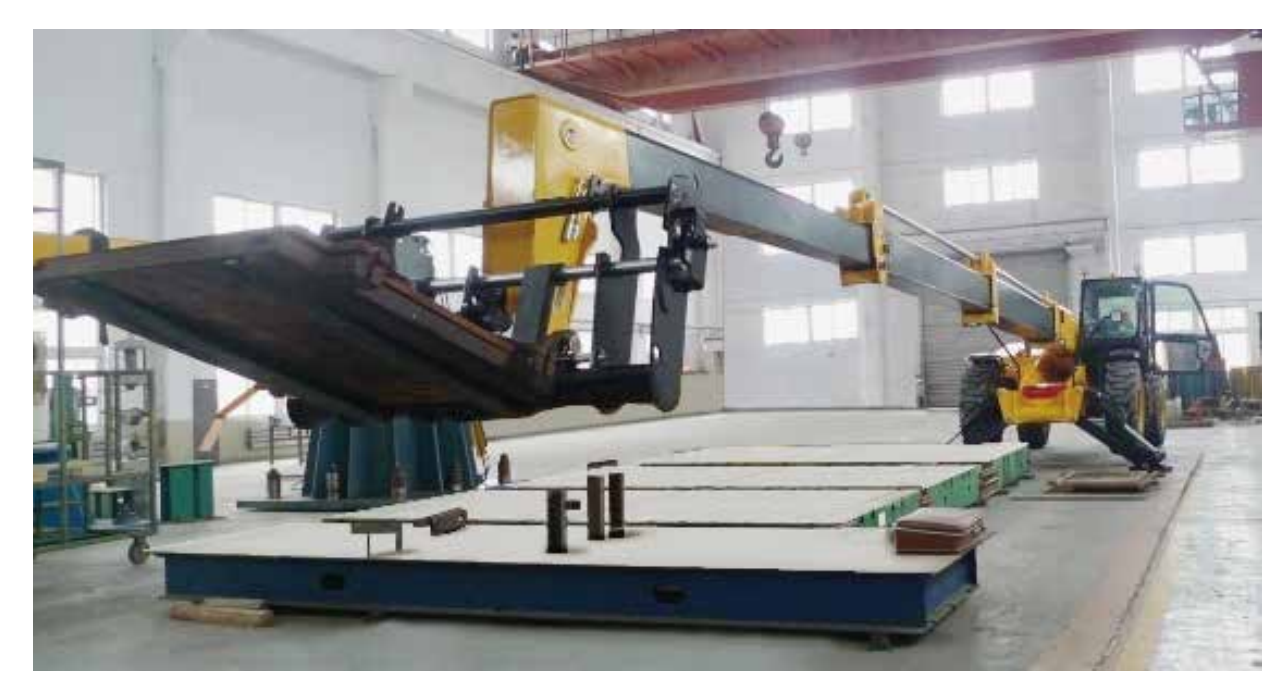
Has passed fatigue load and overload tests of 200,000 times

• The critical structural parts, such as telescoping boom, are proved by stringent durability test to meet the needs of diversified severe working conditions.